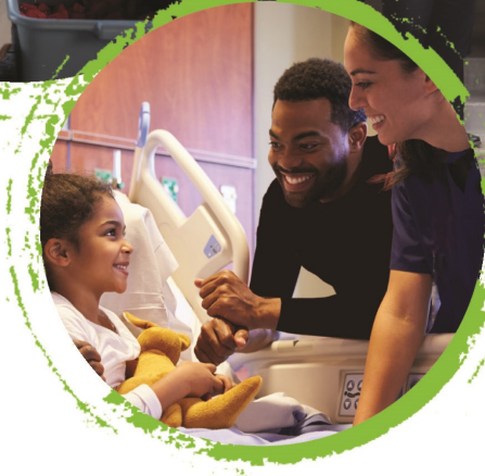
PICTURED FROM TOP LEFT: Youth Migrant Project, Seminarians, Hospital ministry